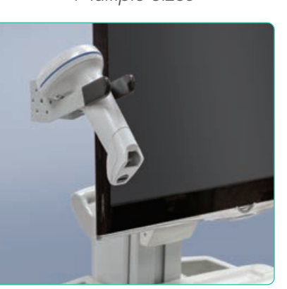
Forked Scanner Holder