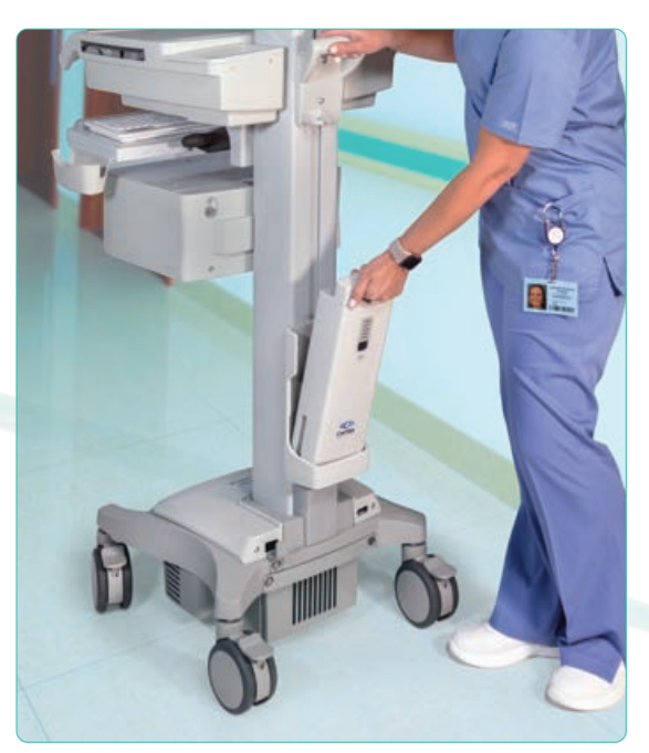
GoLife™ Swappable Battery