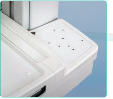
Scanner Base Plate