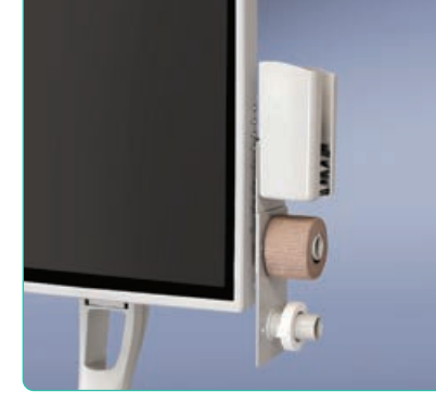
Access Pack Multiple Sizes