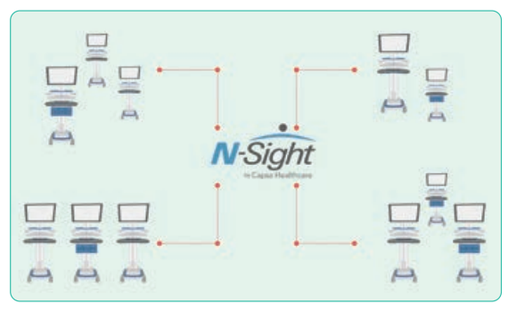
Optimize Your Fleet