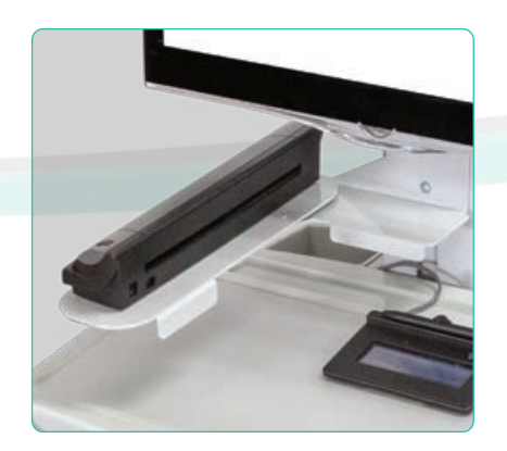
Document Scanner Shelf

Visit CapsaHealthcare.com for more convenient accessories.