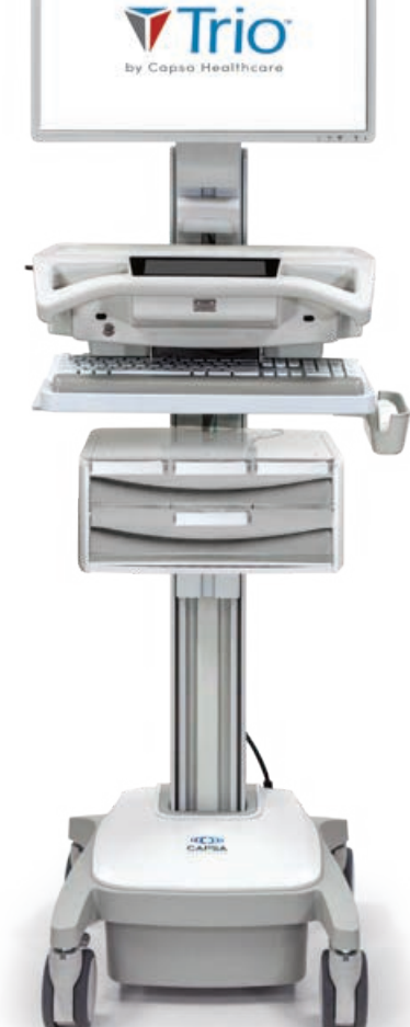
Trio with Standard Bins