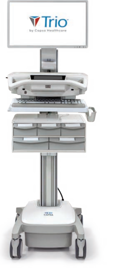
Trio with MaxBin System

The NEW MaxBin system provides storage for medication and supplies for almost any care environment. The MaxBin's unique configurable design provides options for simple 1-tier up to expansive 5-tier designs.